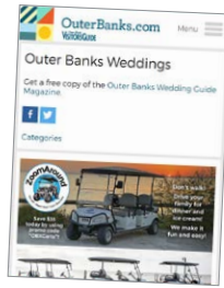
Sample Gold Level Package Page