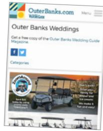
Sample Gold Level Package Page